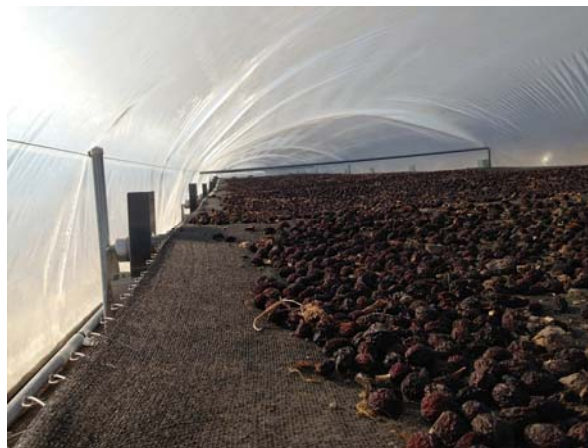
Plums in a CK2 solar tunnel (2014)