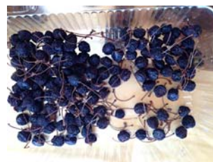
Cherries dehydrated in a CK2 solar tunnel (2015)