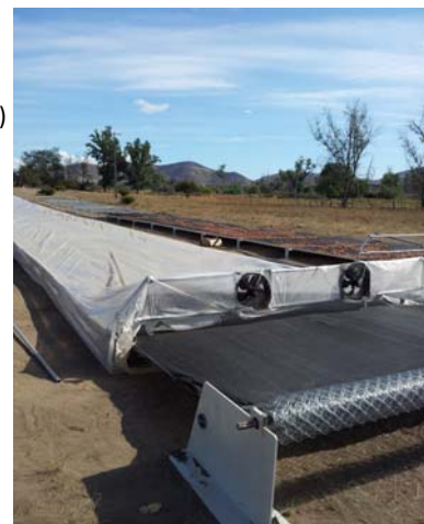
1 st prototype of the solar dryer (2012)