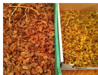
Grapes dehydrated in a CK2 solar tunnel (2015)